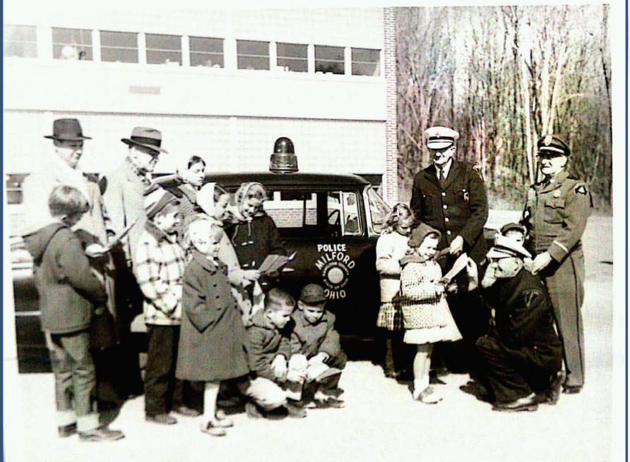
A photograph from the 1950s taken at Milford South Elementary demonstrating that the Milford Police Department has a long history of community partnerships.