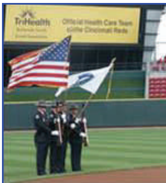
Great American Ball Park

The Milford Police Department Honor Guard is a team of specially trained officers that reflect the commitment to excellence, spirit of professionalism and the esprit de corps of all the members of the Milford Police Department. The Honor Guard has been requested to participate in many formal ceremonies and events throughout the community. The team leader is also assigned to the Hamilton County Police Association's Honor